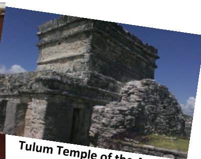
Tulum Temple of the Arts