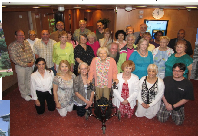
Group photo on-board the Liberty of the Seas