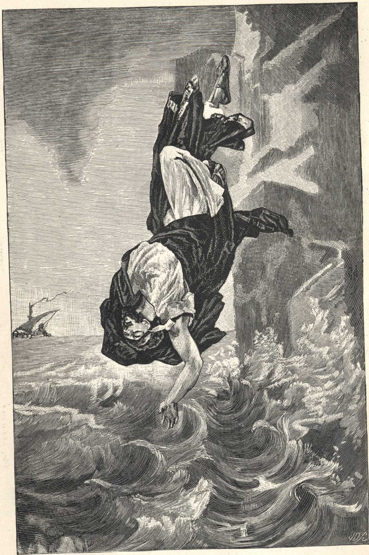
DEATH OF AEGEUS.