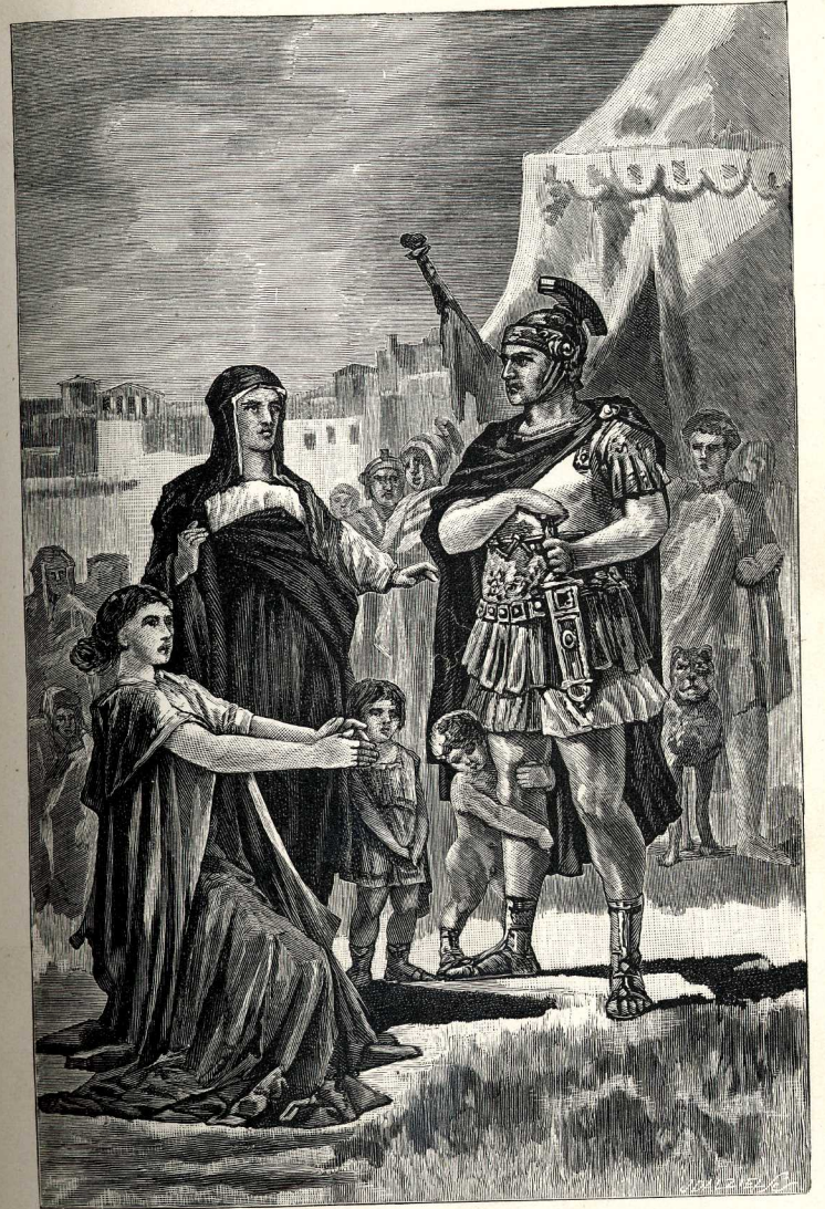
CORIOLANUS AND HIS MOTHER.

Although he knew that the Volscians would never forgive him