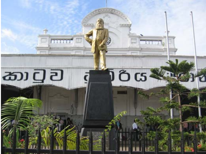
Statue of Henry S. Olcott in Colombo, Sri Lanka.

Olcott's ritual passage to South Asia replicated significantly his pioneering ancestor's "errand into the wilderness" and strangely the "errand to the world" conducted by America's nineteenth-century Protestant missionaries. However, being an outsider was an asset in some cases. For instance, when Olcott initially visited Japan, he was informed that only an outsider, a foreigner who seriously and faithfully practiced the Buddhist